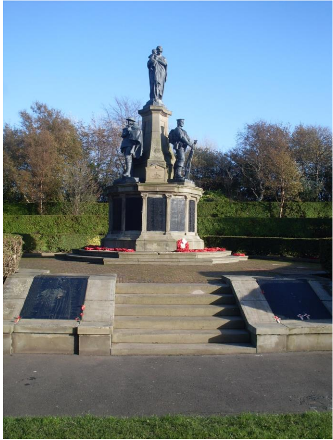
Bootle War Memorial