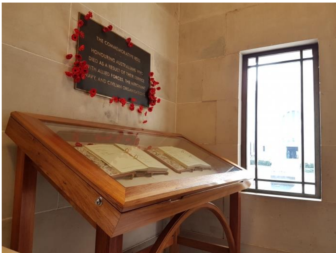
Commemorative Roll Book at The Australian War Memorial