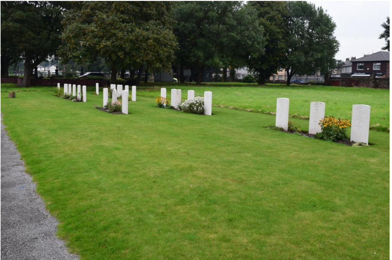
Commonwealth War Graves in Bootle Cemetery